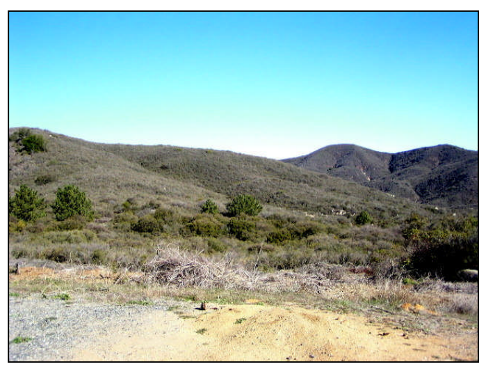
Photograph 6: View from El Cariso Hot Shot candidate location, facing northeast.