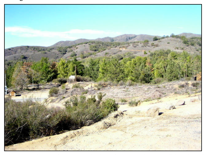
Photograph 4: View toward El Cariso Hot Shot candidate location, facing northwest.