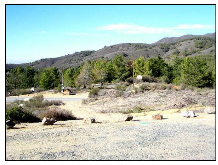
Photograph 3: View toward El Cariso Hot Shot candidate location, facing west.