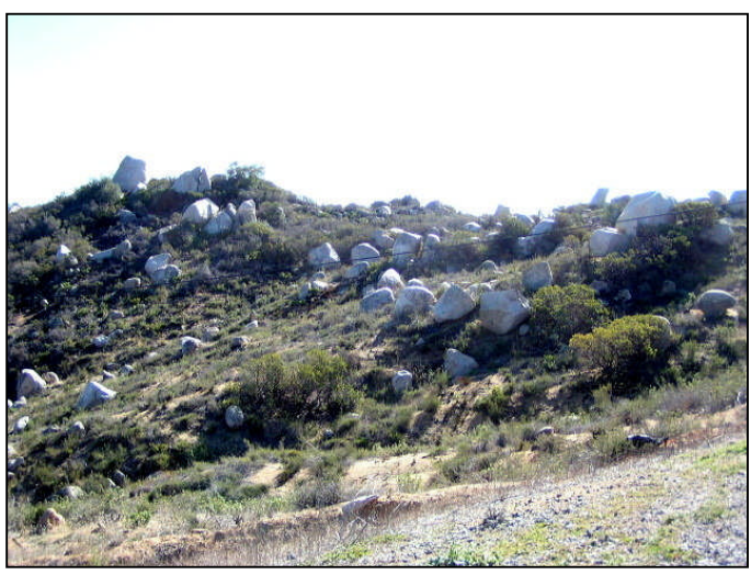
Photograph 5: View from El Cariso Hot Shot candidate location, facing southeast.