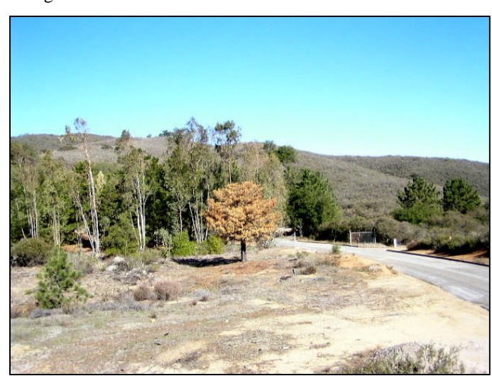
Photograph 7: View from El Cariso Hot Shot candidate location, facing north.