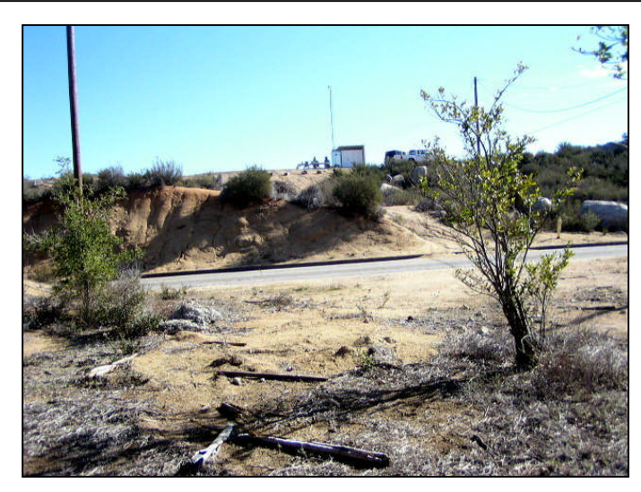
Photograph 1: Overview of El Cariso Hot Shot candidate location, facing east.