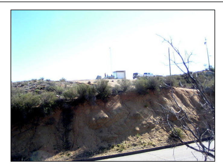
Photograph 2: Overview of El Cariso Hot Shot candidate location, facing southeast.